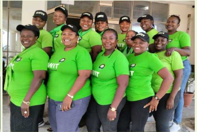
PLATEAU CHAPTER WAS PART OF THE CELEBRATION OF THE INTERNATIONAL WOMEN'S DAY AS ALL THE MEMBER CAME TOGETHER AND OBSERVED THE DAY WITH THE THEME FOR INTERNATIONAL WOMEN'S DAY, 8 MARCH 2023 (IWD 2023) IS, "DIGITAL: INNOVATION AND TECHNOLOGY FOR GENDER EQUALITY".