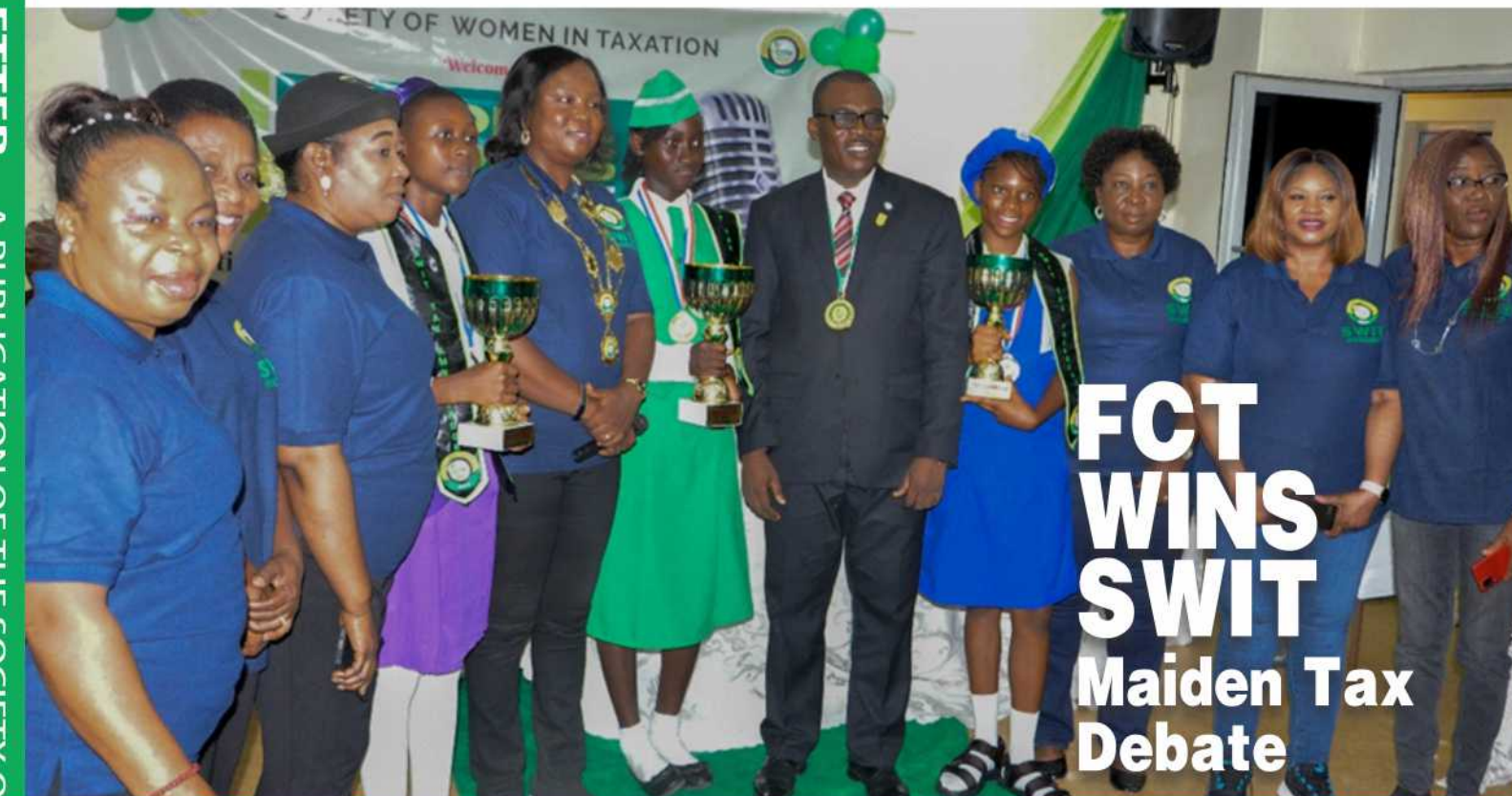
FCT WINS SWIT Maiden Tax Debate