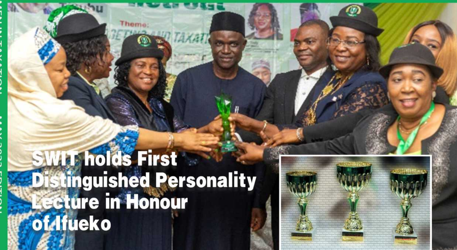
SWIT holds First Distinguished Personality Lecture in Honour of Ifueko