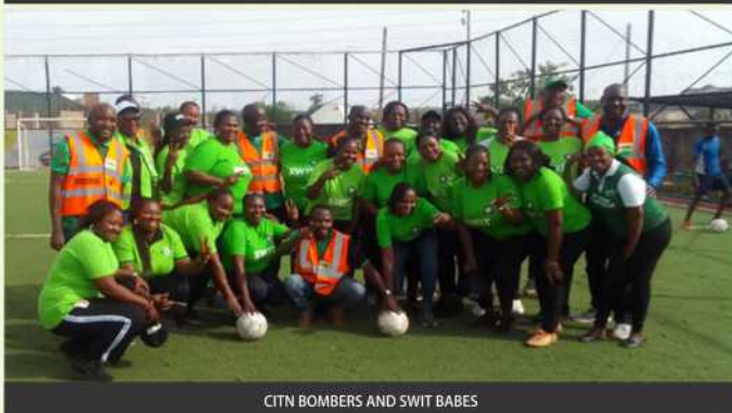
CITN BOMBERS AND SWIT BABES