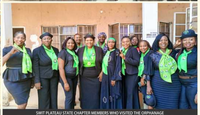
SWIT PLATEAU STATE CHAPTER MEMBERS WHO VISITED THE ORPHANAGE