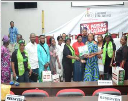
Presentation of gift to representative of BACCIMA