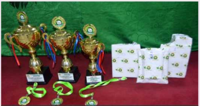
L-R: Trophies and gifts for the first, second and third position in order of presentation