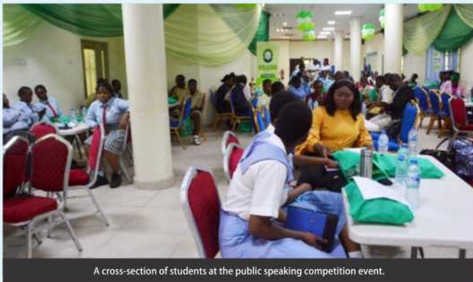
A cross-section of students at the public speaking competition event.