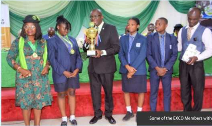
Some of the EXCO Members with the top three Winners at the event.