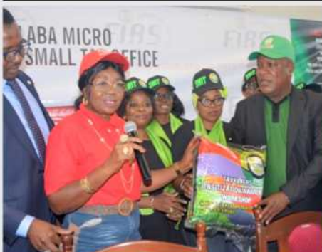
The Outreach Committee presentation of gift to representative of LIRS.