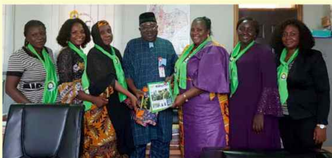
Presentation of Jos and District Society uniform to the Tax Controller