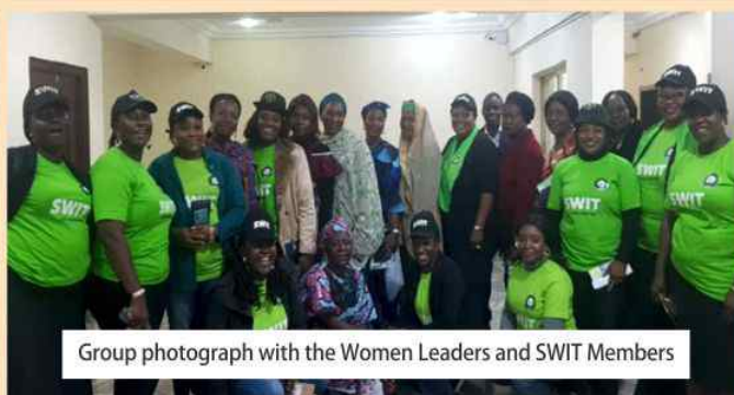
Group photograph with the Women Leaders and SWIT Members