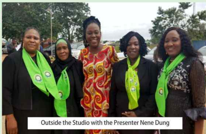
Outside the Studio with the Presenter Nene Dung