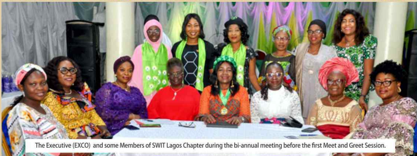
The Executive (EXCO) and some Members of SWIT Lagos Chapter during the bi-annual meeting before the first Meet and Greet Session.