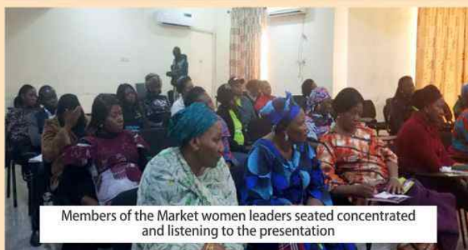
Members of the Market women leaders seated concentrated and listening to the presentation