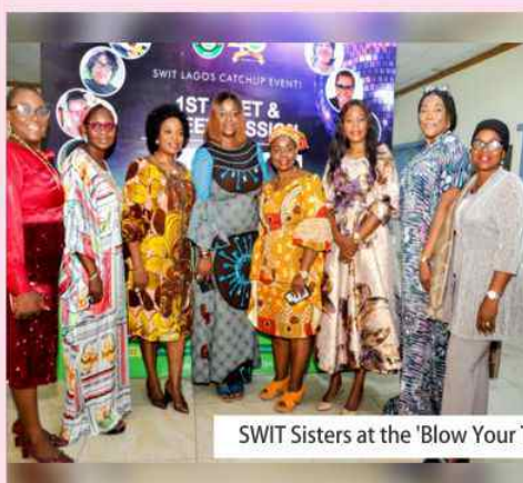
SWIT Sisters at the 'Blow Your Trumpet' Demonstration Session