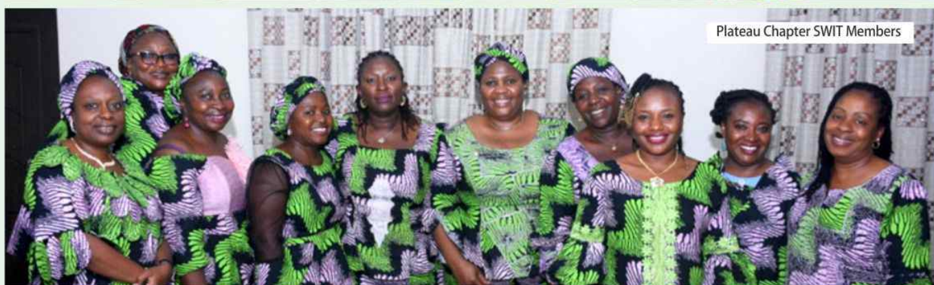
Plateau Chapter SWIT Members

T he role of professional women in National Building; discussion of a paper presented by Hon. Abike Dabiri Erewa by Adesina Adedayo, mni FCTI the President of the Institute gave more clarification and insight on: